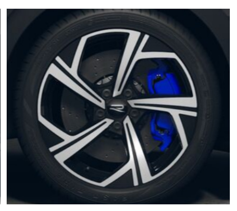
STANDARD ON R 18" 'Jerez' alloy wheels 7.5J x 18 Tyres: 225/40 R18 with sporty vehicle dynamics

STANDARD ON GTI & CLUBSPORT 18" 'Richmond' alloy wheels, Black/ diamondturned surface 7.5J x 18 Tyres: 225/40 R18 with sporty vehicle dynamics