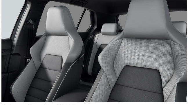
'Vienna' Leather WL3 Pack Soul-Crystal Grey (UN) Optional on GTE