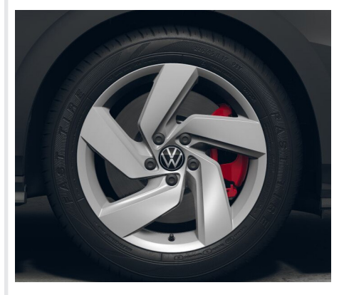
STANDARD ON GTE 17" 'Richmond' alloy wheels 7J x 17 Tyres: 225/45 R17 with sporty vehicle dynamics

The addition of optional extras may result in the vehicle increasing in Co2 g/km and therefore, attracting a higher rate of VRT than described in this product guide. For your exact configuration value, both Co2 g/km and RRP, please visit volkswagen.ie configurator.