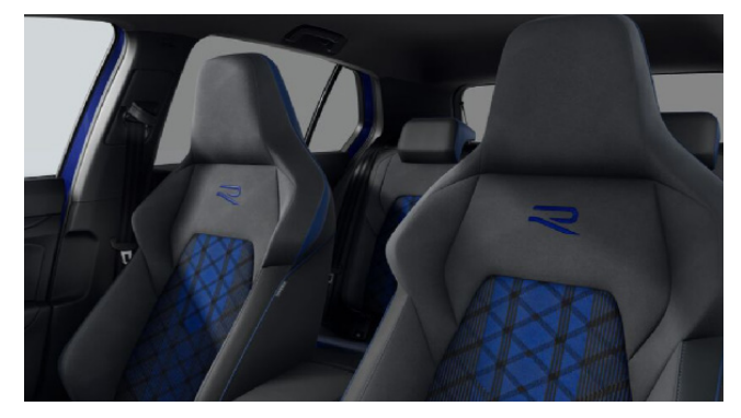
'Scale Paper' fabric Soul Blue (OB) Standard on R & R Black Edition