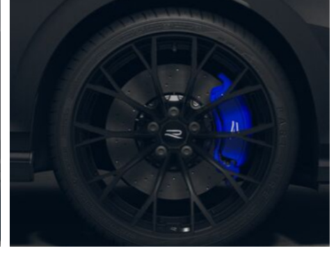
OPTIONAL ON R 19" Warmenau Alloy Wheels in Black 8J x 19 Tyres: 235/35 R19