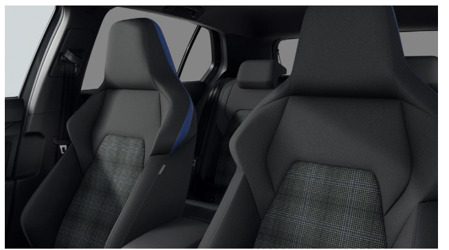
'Scale Paper' fabric Soul Black-Blue (UP) Standard on GTE