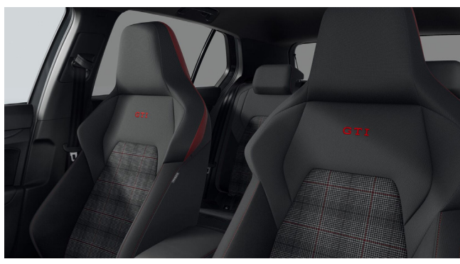
'Scale Paper' fabric Soul- Tornado Red (UG) Standard on GTI