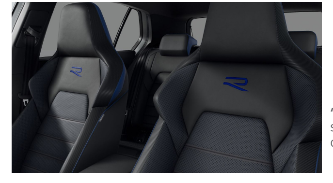
'Nappa' Leather WL5 Pack Soul Blue (OB) Optional on R

* Optional at extra cost. Please note, the print processes do not allow exact reproduction of the upholstery colours.