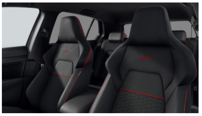
'Scale Paper' fabric Soul Black - Tornado Red (UG) Standard on GTI Clubsport