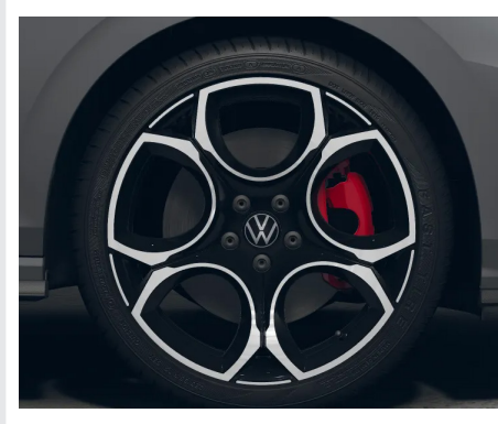
OPTIONAL ON GTI 19" Queenstown Alloy Wheel, Black, diamond-turned surface 8J x 19 Tyres: 235/35 R19

OPTIONAL ON GTI, CLUBSPORT, R 19" Estoril Alloy Wheels, Black/ Diamondturned surface 8J x 19 Tyres: 235/35 R19 Note: On Golf R disc brakes finished in blue