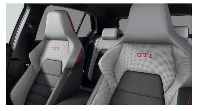
'Vienna' Leather WL3 Pack Soul- Tornado Red (UG) Option GTI & Clubsport