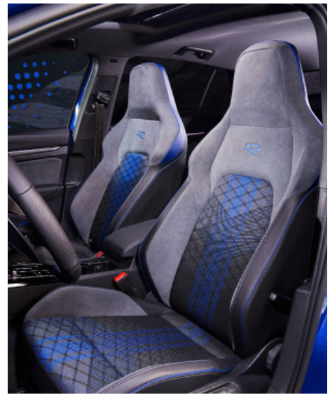
Note: The above images may display optional extra equipment