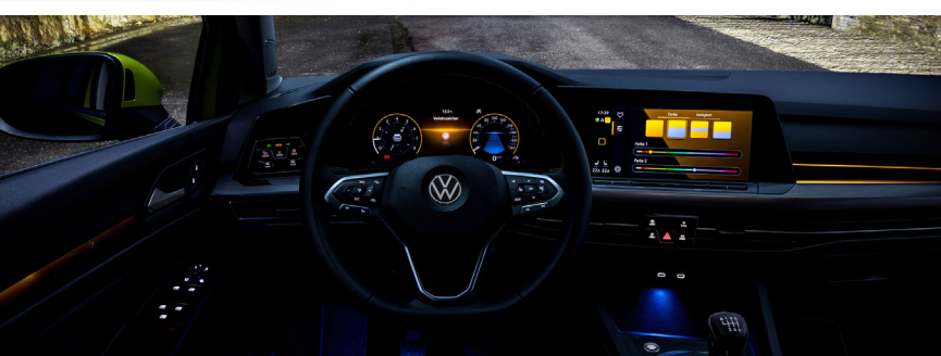
*Mobile Key functionality is only available on selected smartphones. To view compatible phones please visit https://www.volkswagen.ie/en/connectivity/we-connect/all-services.html

Note: Traffic Jam Assist only on Automatic models