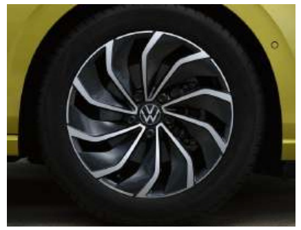
OPTIONAL ON LIFE & STYLE 17" Ventura alloy wheels 7.5J x 17 Tyres: 225/45 R17