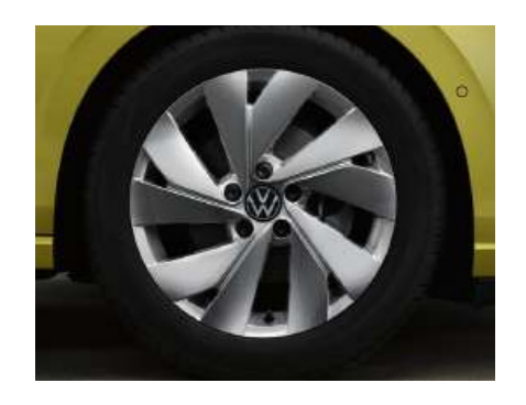
STANDARD ON STYLE 17" Belmont alloy wheels 7.5J x 17 Tyres: 225/45 R17