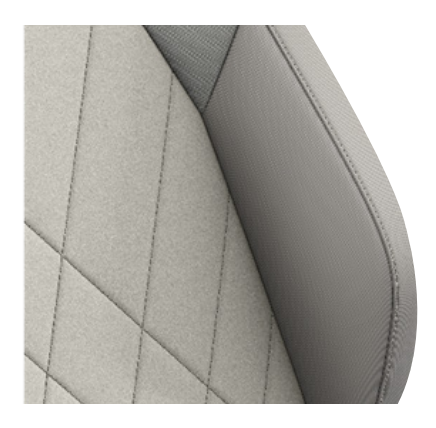
'ArtVelours' cloth Storm Grey (CE) Standard on Style models