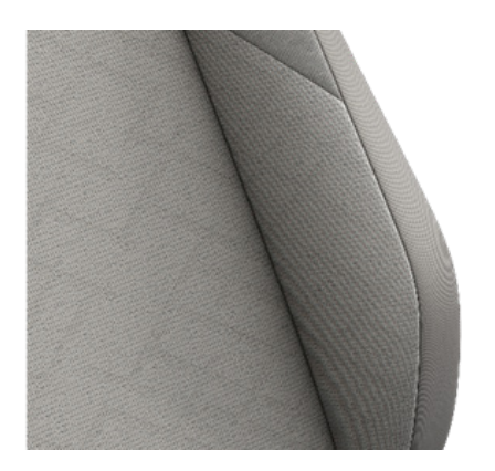
'Maze' cloth Storm Grey (CE) Standard on Life models