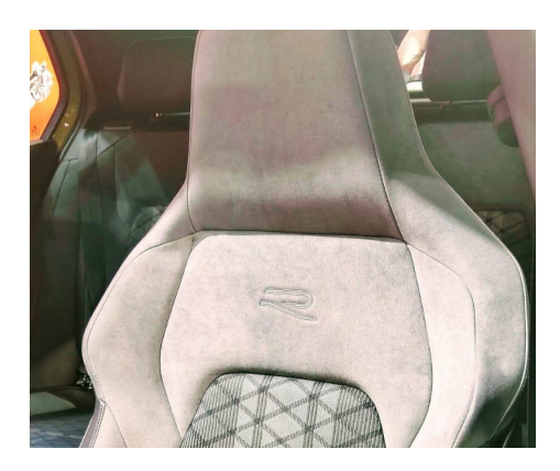
'R-Line' cloth Anthracite (IR) Standard on R-Line