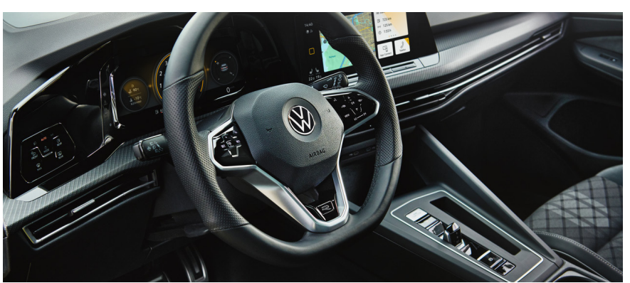
Note: The above image displays DSG Gear Selector