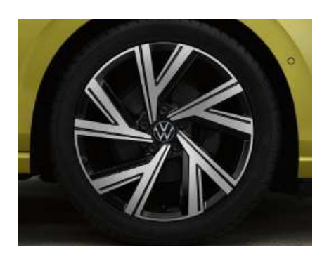
OPTIONAL ON STYLE & R-LINE 18" Bergamo alloy wheels 7.5J x 18 Tyres: 225/40 R18