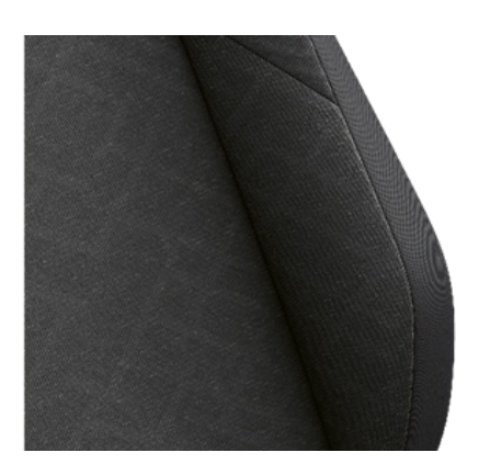
'Maze' cloth Soul (BD) Standard on Life models