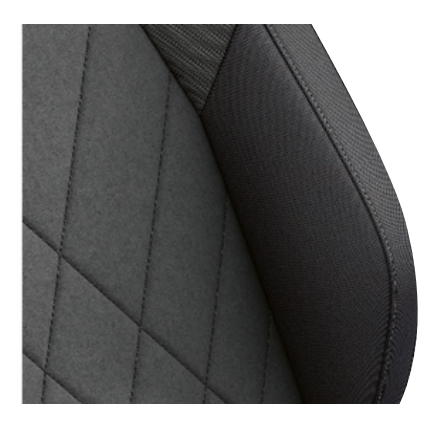
'ArtVelours' cloth Soul (BD) Standard on Style models