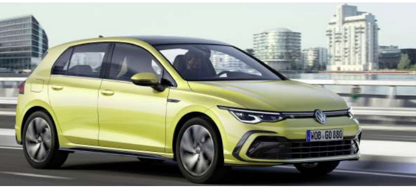
Note: The above image displays optional Panoramic Sunroof, Matrix lights and 18" Bergamo alloy wheels