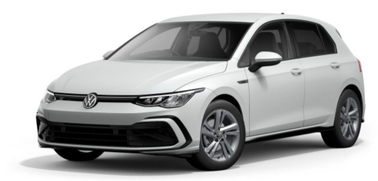
The above specifications are for information purposes only as our products are continually updated and changes may be made to the specifications at any time. If you require any specific feature, you must consult your local dealer who is regularly updated with any change in specification. Specifications are subject to change without notice.