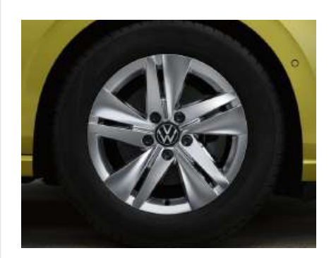
STANDARD ON LIFE 16" Norfolk alloy wheels 7J x 16 Tyres: 205/55 R16

The addition of optional extras may result in the vehicle increasing in Co2 g/km and therefore, attracting a higher rate of VRT than described in this product guide. For your exact configuration value, both Co2 g/km and RRP, please visit volkswagen.ie configurator.