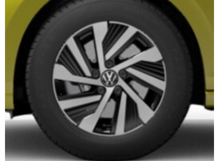
STANDARD ON STYLE eHybrid 16" eHybrid alloy wheels 7J x 16 Tyres: 205/55 R16