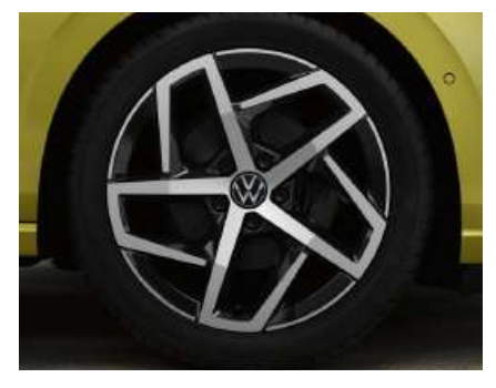
OPTIONAL ON STYLE 18" Dallas alloy wheels 7.5J x 18 Tyres: 225/40 R18