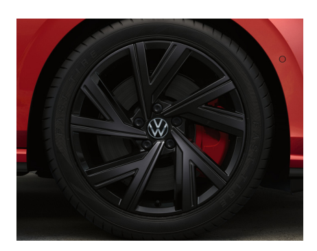
OPTIONAL ON R-LINE 18" Bergamo alloy wheels finished in black 7.5J x 18 Tyres: 225/40 R18

Note: The above image shows 18" Bergamo alloy wheel in black on Golf GTI model