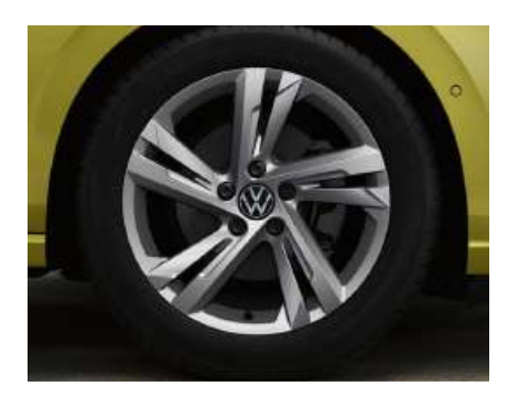
STANDARD ON R-LINE 17" Valencia alloy wheels 7J x 17 Tyres: 225/45 R17